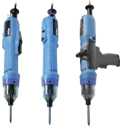
DLV7104 series DLV8104/DLV8204 series DLV8154