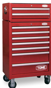
WS207R + WS122R