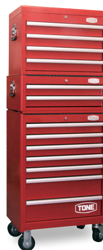
WS207R + WS122R + WS114R