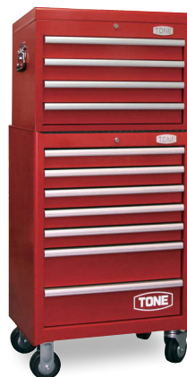
WS207R + WS114R