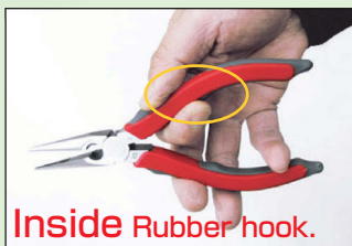
Inside Rubber hook.

3 Even if it is used downward, the hook will prevent it from slipping down from your hand.