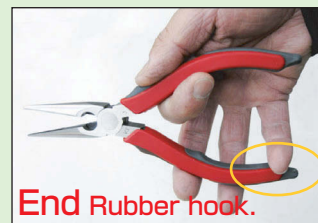
End Rubber hook.

4 Hook will pass the force from your fingertip.