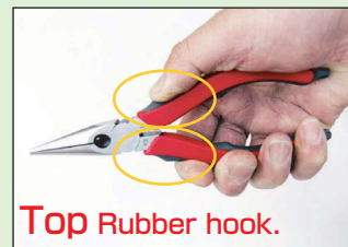
Top Rubber hook.

2 Even if oil is adherent, hook fits your fingertip.