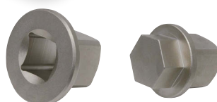
Conversion Adapter Convex Adapter (6pt)